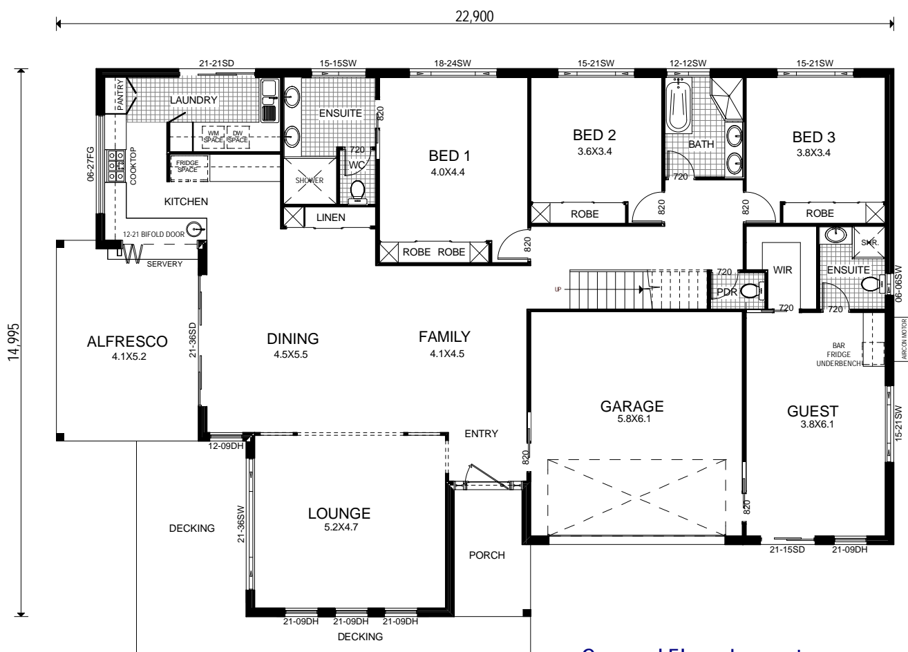
Ground Floor Layout